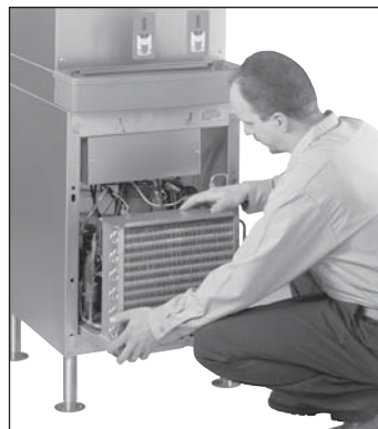
Icemaker in base slides out easily for service