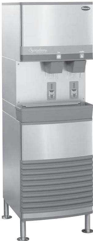
Freestanding model shown with SensorSAFE accessory