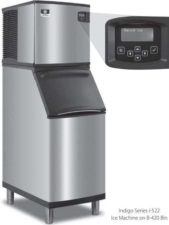
Indigo Series i-522 Ice Machine on B-420 Bin

Designed for operators who know that ice is critical to their business, the Indigo™ Series ice machine's preventative diagnostics continually monitor itself for reliable ice production. Improvements in cleanability and programmability make your ice machine easy to own and less expensive to operate.