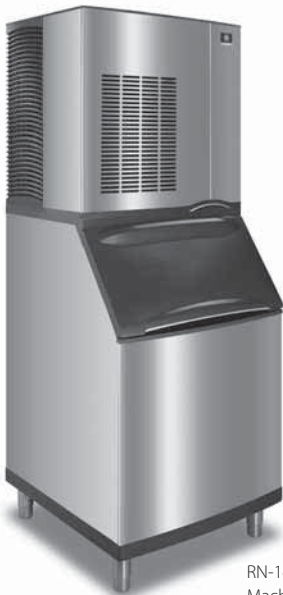
RN-1408A Nugget Ice Machine on B-570 Bin