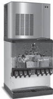
RN-1408A Nugget Ice Machine on Servend SV-250 Dispenser