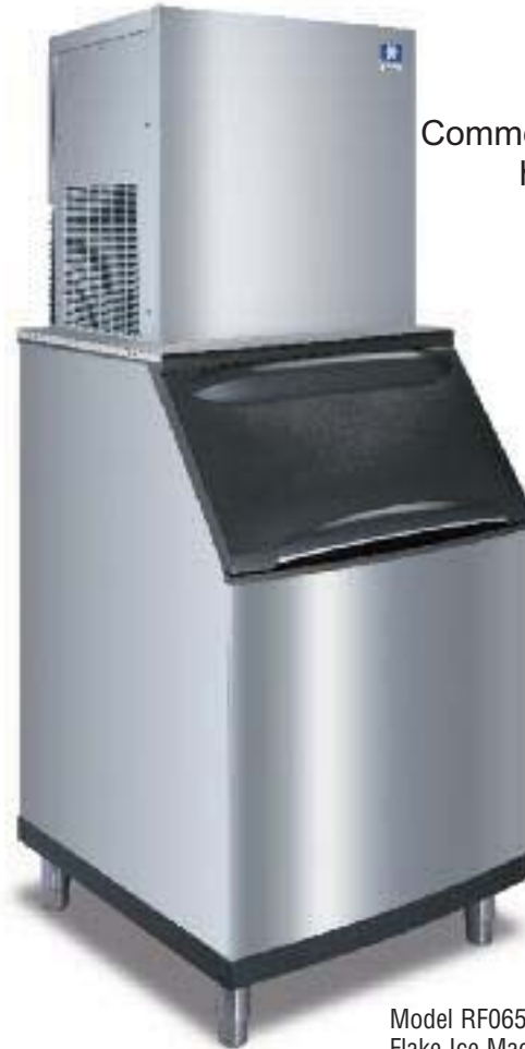
Model RF0650A Flake Ice Machine on B-570 Bin

Distributed by: Commercial Refrigeration Service, Inc. http://www.IceCubes.NET toll free 866 IceMakers 866 423-6253 623 869-8881